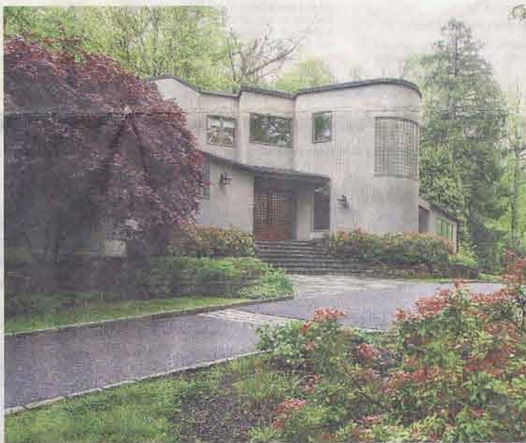
The distinctive front double doors were part of the renovation, making the entry larger. The insulated glass let in light while making a grand statement.