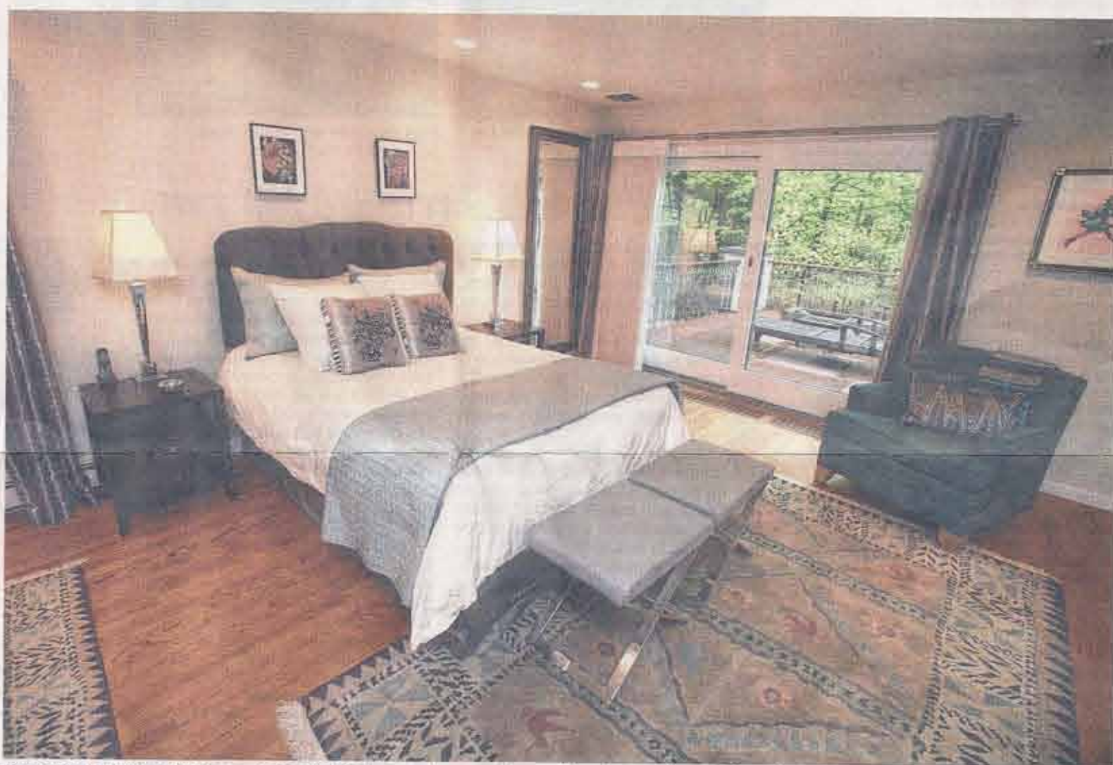
The master bedroom suite has some expected features, such as a custom walk-in closet and beautiful ensuite bathroom. But it also has a built-in coffee/wine bar and an outdoor deck.

One room was converted to a dedicated office designed by Kurth and featured in a Taunton