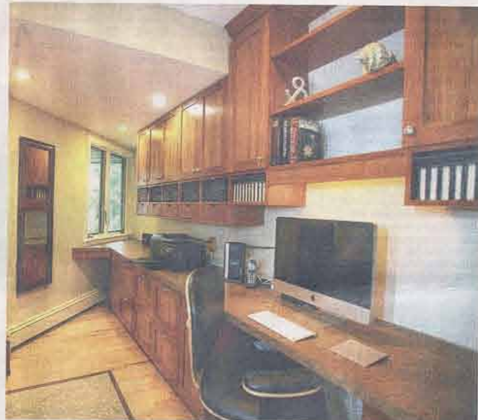
Carol Kurth designed the home's dedicated office space, which was featured in a Taunton Press book by workplace designer and architect Neil Zimmerman — “At Work At Home: Design Ideas for Your Home Workplace” published in 2001.

every door handle was handcrafted; under-stair rope lighting was installed on the steps connecting the master bedroom and sitting room; high-tech bathrooms were updated to elegant marble; and one master bedroom wall was lined with custom mirrored storage. And that industrial gray carpeting? Gone! It was replaced by