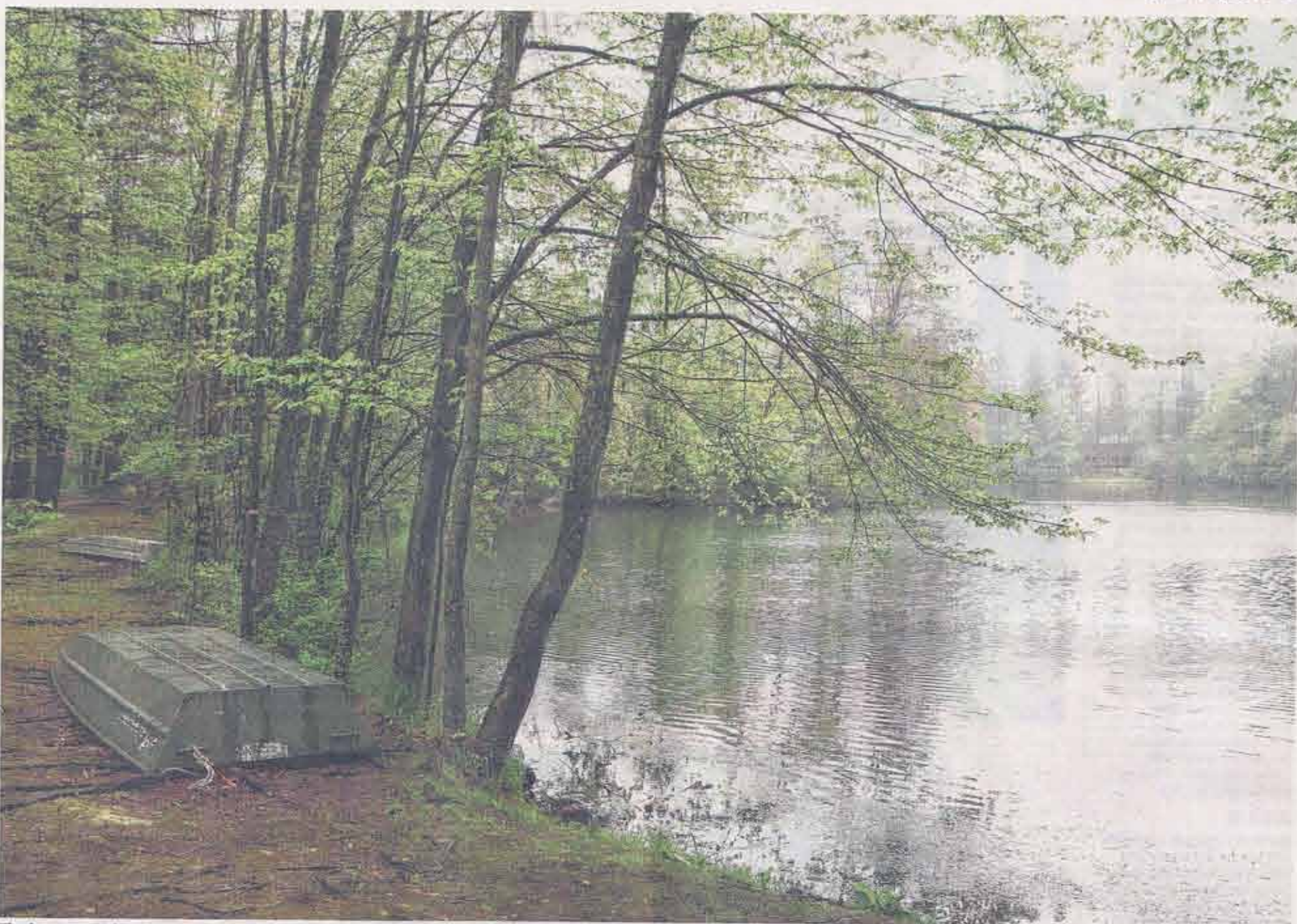
The house, which is surrounded by 150 acres of open space is near a lake, great for boating in summer and skating in winter.

green, I wanted it to be more of a continuation of the outside. I wanted a more refined look and feel — something more sophisticated and less chunky than the traditional Craftsman style.”