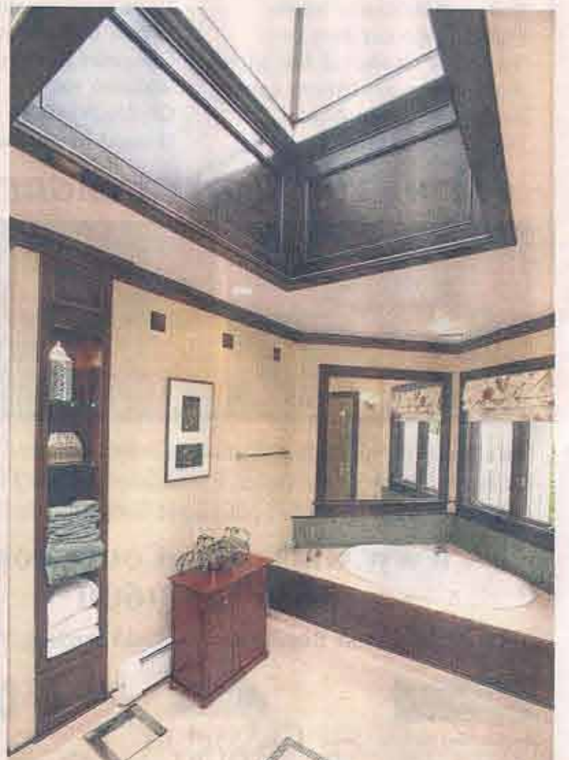
Even the bathrooms were renovated from high-tech to a more warm and welcoming feel with elegant marble, neutral colors and dark wood accents.